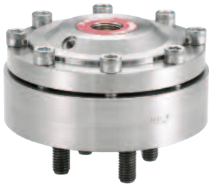
Type 702 – Low Pressure Flanged ½, ¾, 1, 1½, 2, 3 NPT