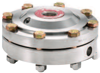
Type 741 – Threaded (w/flushing conn.) ¼, ½, ¾, 1 NPT